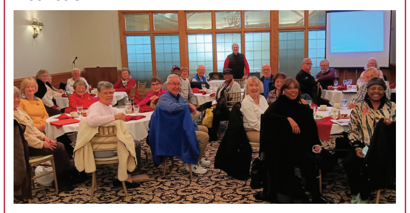
Montgomery County Chapter meeting