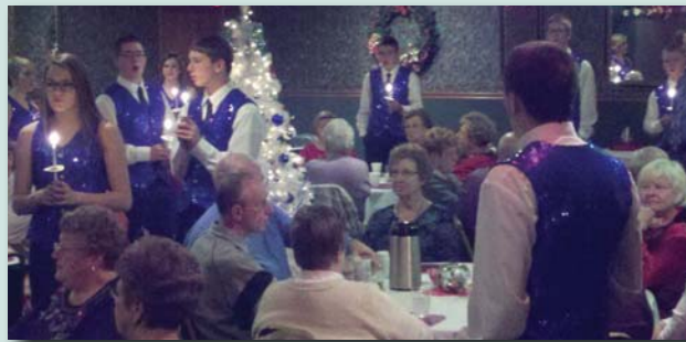
The PERI Chapter 15, Putnam County, Christmas luncheon was held at Dick's Steak House, Kalida, Ohio. The entertainment was the Ottawa Glandorf High School Show Choir.