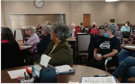
Wood County February Chapter meeting