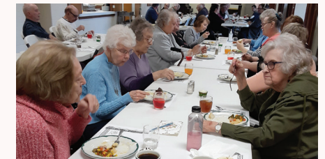
The Wyandot chapter enjoyed a Lenten luncheon before a program about the Developmental Disabilities services in Wyandot County at their March 9th meeting.