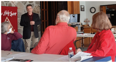
Impaired Vision Services presentation at the Marion Co. chapter meeting.