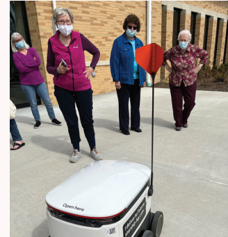
Wood County Chapter's March program was on the BGSU robot delivery service.