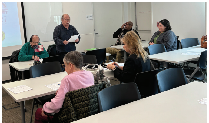
Franklin County chapter meeting