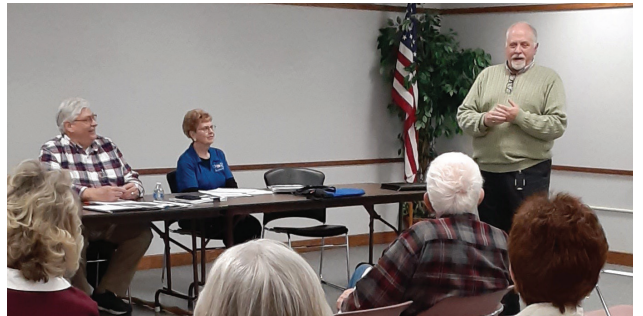
Speaker from the Board of Elections