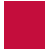
Vacant District 10