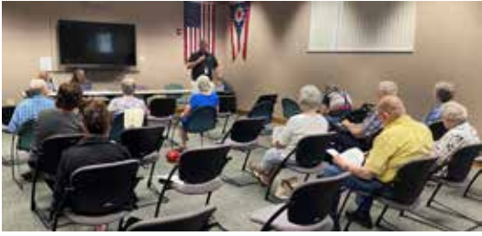
Ottawa County Chapter #82 Meeting