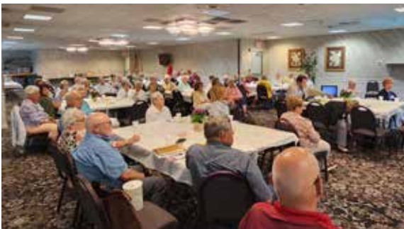
Members gather for the District 10 Annual Meeting.