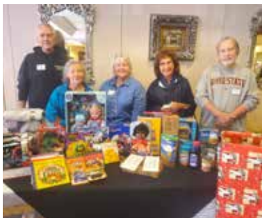
On Oct 10, Stark County Chapter members brought donations of toys and canned goods for local holiday giving.