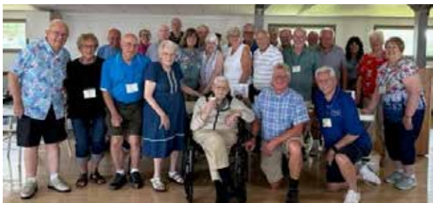
Lake County Chapter #28 holds their Annual Picnic