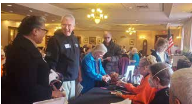
Stark County Chapter #20 members check in prior to hearing a presentation from the Social Security Administration and a receiving lunch at La Pizzeria Restaurant.