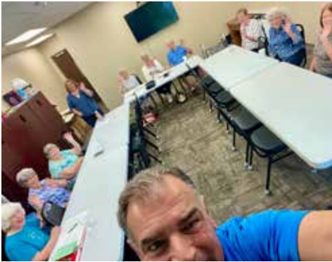
Greene County Chapter #24 meeting