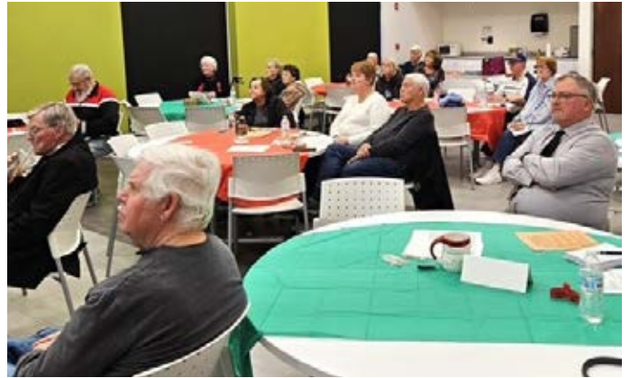
Shelby County Chapter meeting