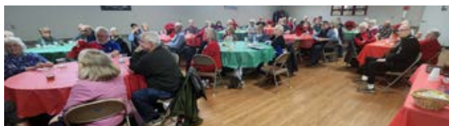
Fairfield County Chapter meeting