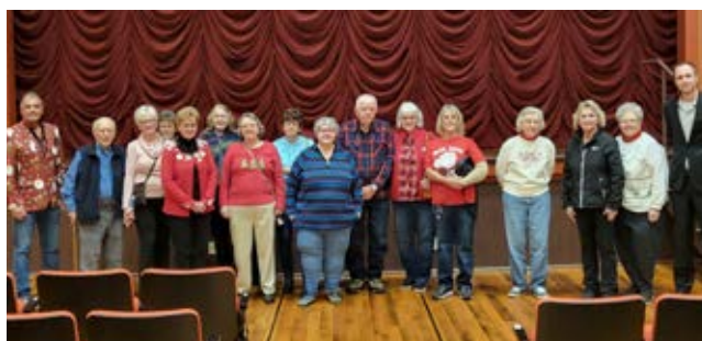
Knox County Chapter meeting