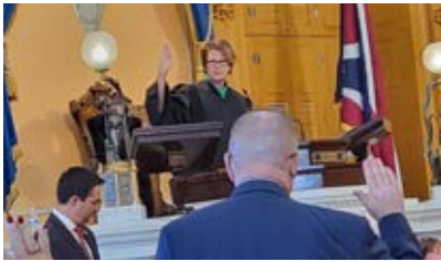
Supreme Court Justice Sharon Kennedy swearing in the 17 electoral delegates prior to their official vote for the 47th president of the United States in the Senate chambers of the Ohio State House.