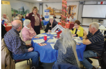
District 9 annual meeting