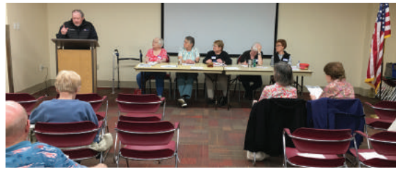
Chapter 91 Cuyahoga chapter meeting