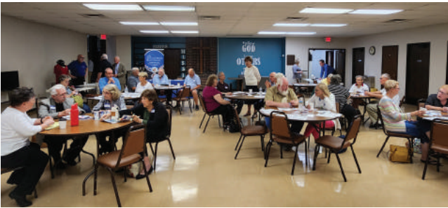
District 7 annual meeting