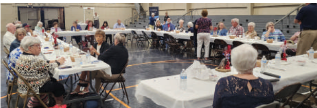
District 8 annual meeting