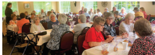
Chapter 45 Hocking County meeting