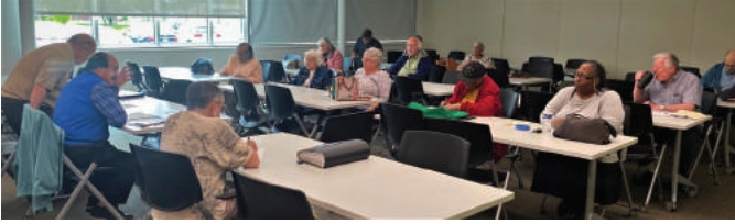
Chapter 1 Franklin County meeting