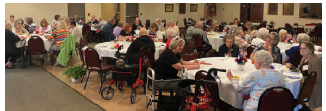
Chapter 63 Portage County chapter meeting