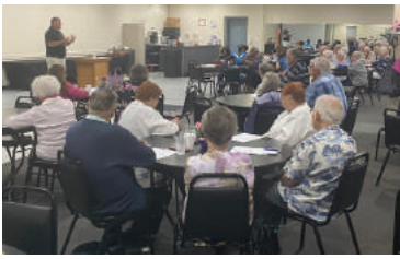
District 1 annual meeting crowd