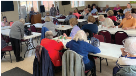
Chapter 89 Cuyahoga chapter meeting