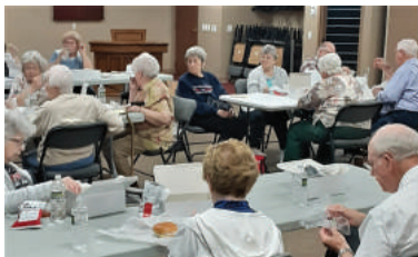
Chapter 85 Crawford County chapter meeting