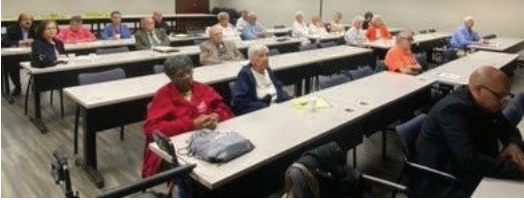
District 6 annual meeting crowd