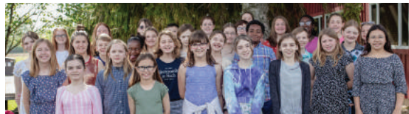
District 3 had the Clark Shawnee 5th Grade Choir perform.