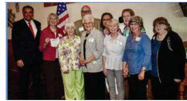
District 3 Chapter of the Year awarded to Greene County