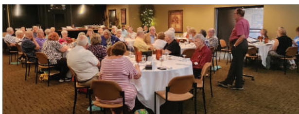
District 11 annual meeting