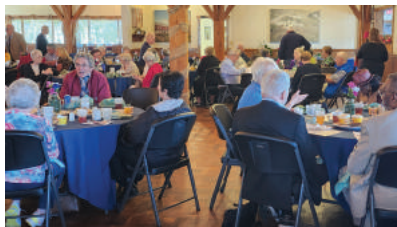
District 3 annual meeting crowd